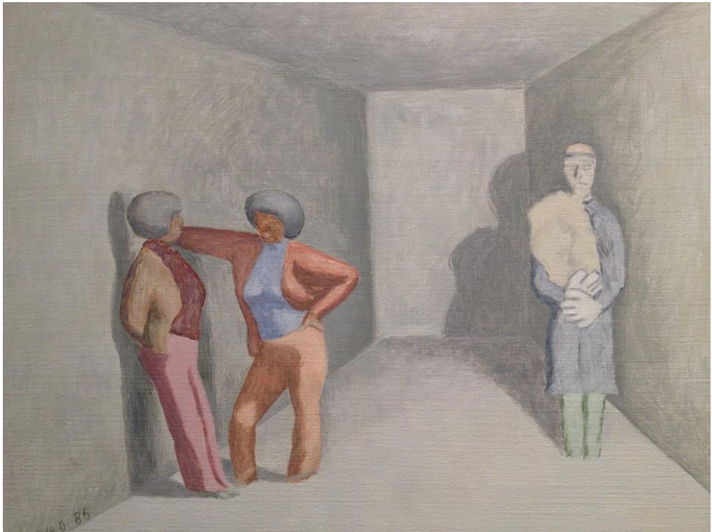
Courtesy of the artist and Greg Kucera Gallery Confab , 1986, oil on canvas, 13 by 16 inches.

What is that? That's what I asked when I passed the above little painting at Greg Kucera Gallery recently. It was next to this other one below, by the same artist.