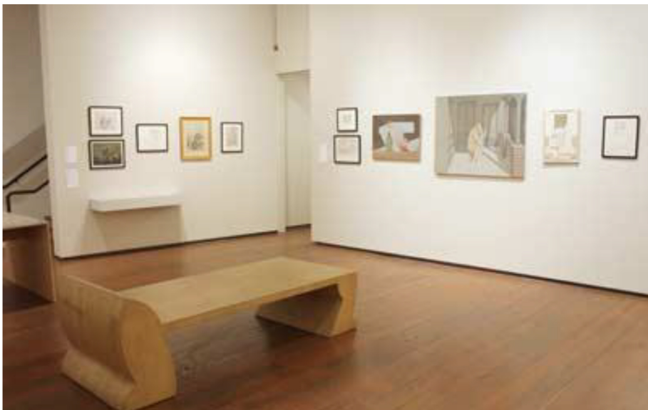
2017 exhibition, Drawing from Painting