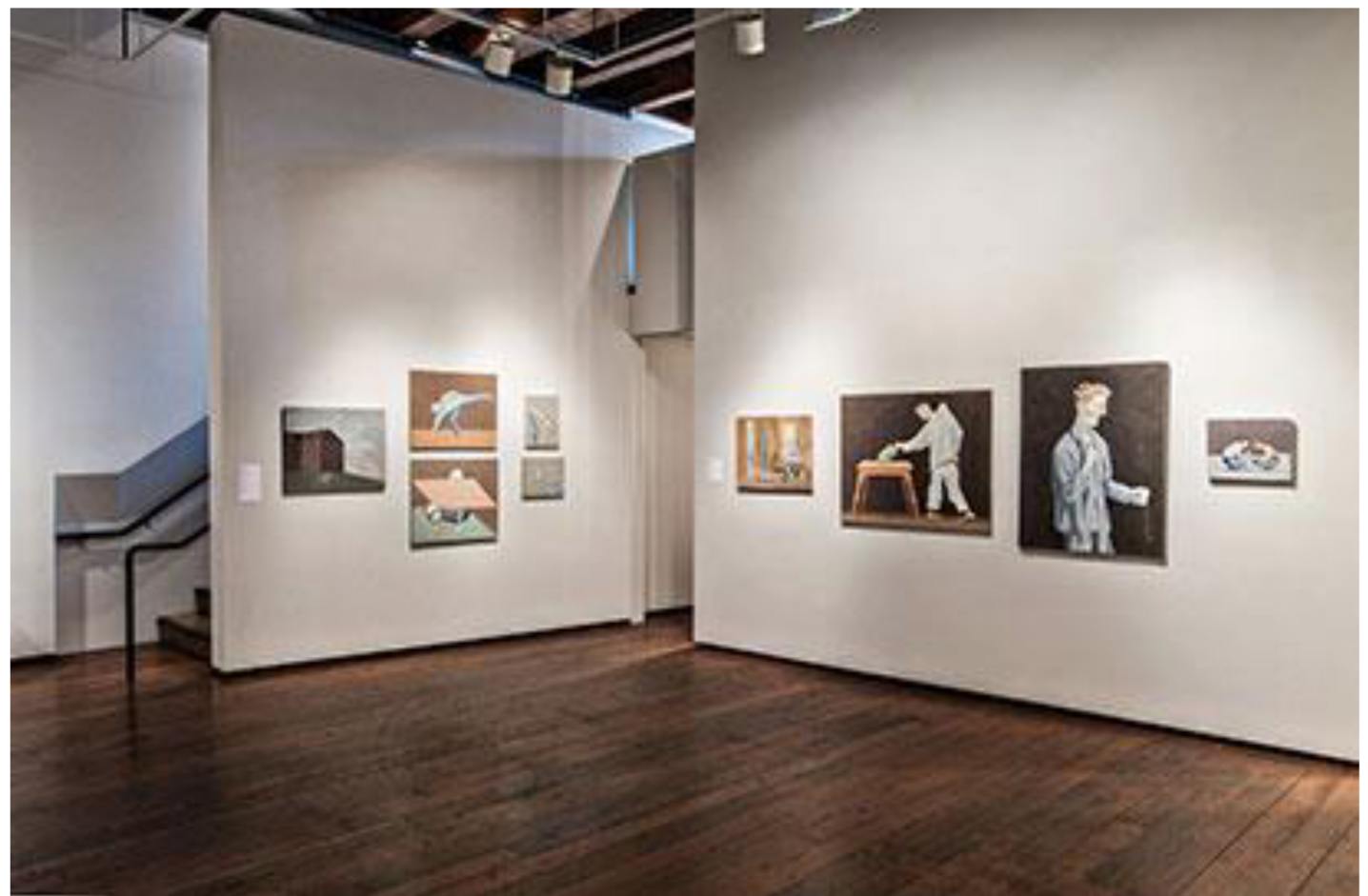
2013 David Byrd installation views at Greg Kucera Gallery