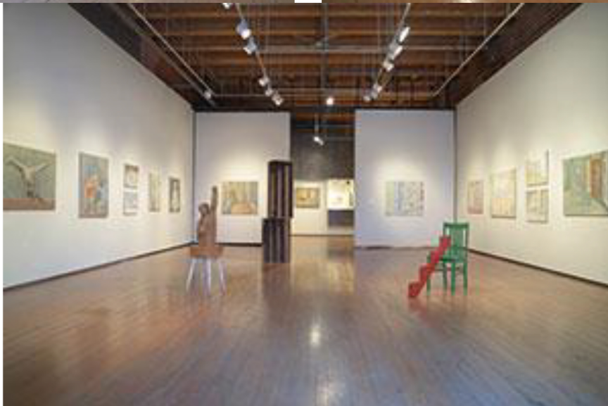
2013 David Byrd installation views at Greg Kucera Gallery